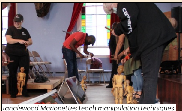
Tanglewood Marionettes teach manipulation techniques

"It was a pleasure to experience work from around the world—without leaving the city... the hands-on workshop I attended (creating puppets out of foam blocks) was fun & should prove useful to me as a drama teacher. Thank you Mayo Street Arts!"