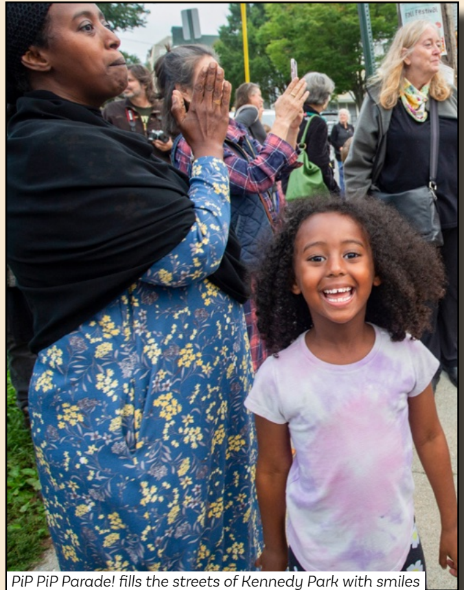
PiP PiP Parade! fills the streets of Kennedy Park with smiles